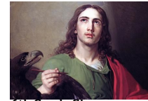
6th Grade Classroom St. John the Apostle

Queridísima Señora de Guadalupe, Madre fecunda de santidad, Enséñame tus caminos De mansedumbre y fortaleza. Escucha mi humilde plegaria Ofrecida con sentida confianza Para implorar este favor (Expresa tu petición). Padre Nuestro, Ave María, Gloria