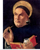
Kindergarten Classroom St. Thomas Aquinas January 28

Grant me grace, O merciful God, to desire ardently all that is pleasing to Thee, to examine it prudently, to acknowledge it truthfully, and to accomplish it perfectly, for the praise and glory of Thy name. In particular, please obtain the favor I ask during this novena: (Make you request here) Grant me, O Lord my God, a mind to know you, a heart to seek you, wisdom to find you, conduct pleasing to you, faithful perseverance in waiting for you, and a hope of finally embracing you. Amen.